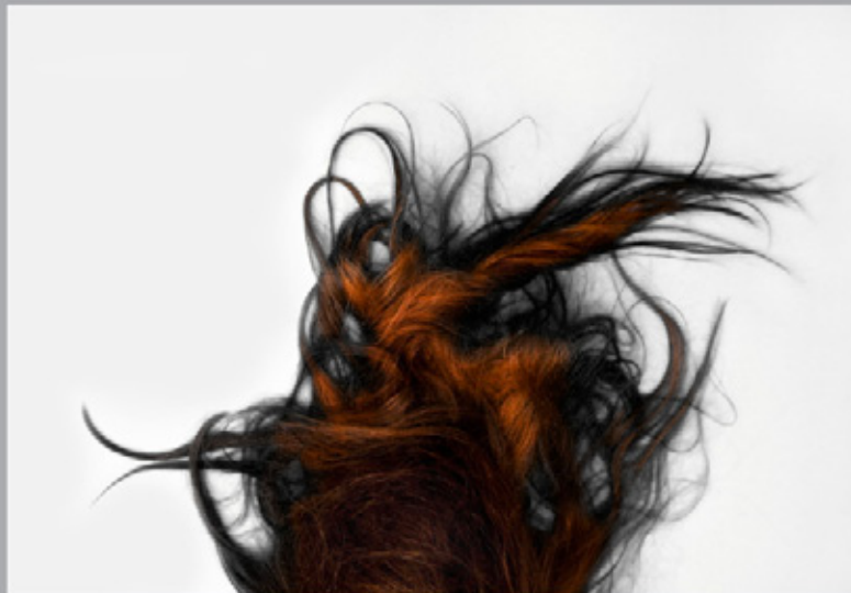
Hair 1, 2009 C-print on aludibond, 210 cm x 145 cm